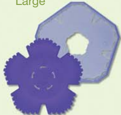
Flower Shape Large