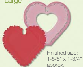
Heart Shape Large

Quick Yo-yo Maker Heart Small Art No. 8704 Quick Yo-yo Maker Heart Large Art No. 8705 Quick Yo-yo Maker Flower Small Art No. 8706 Quick Yo-yo Maker Flower Large Art No. 8707 Assorted Fabrics for Yoyos Craft Glue or Hot Glue Gun