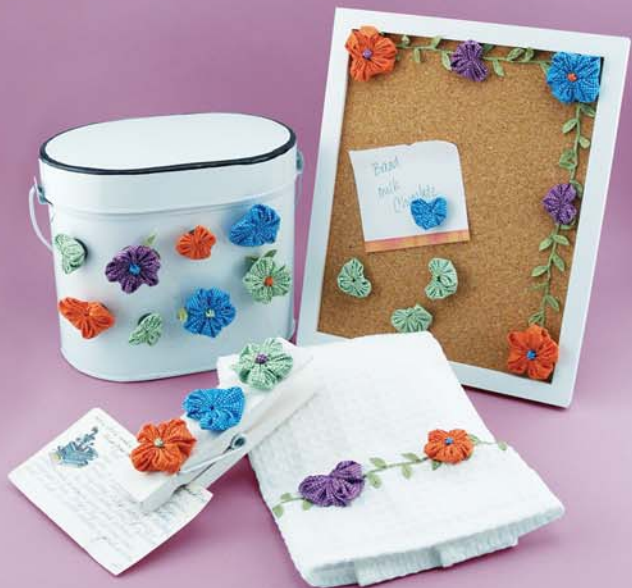
Clothespin Recipe Card Holder